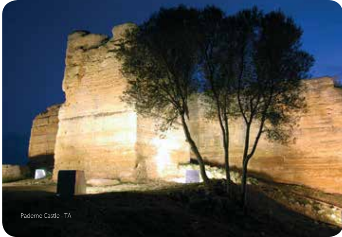
Paderne Castle - TA

Nearby, there is a bridge of medieval origin that retains a stretch of the old road and a water mill with its weir.