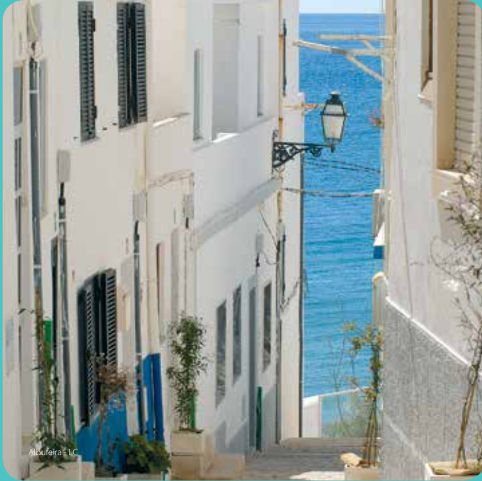
Albufeira - LC