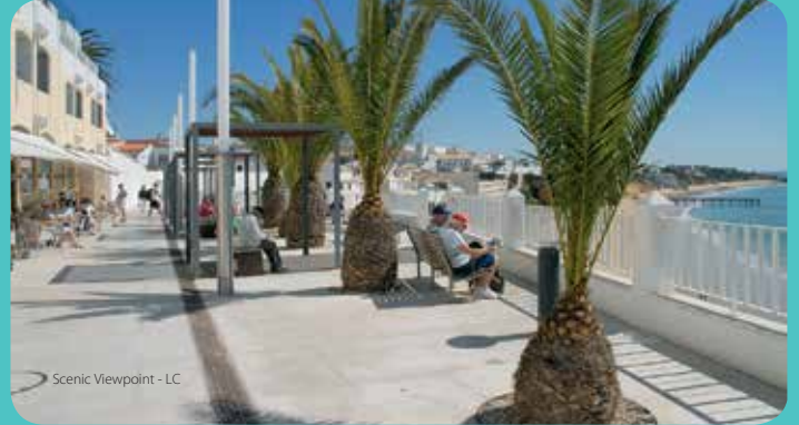
Scenic Viewpoint - LC