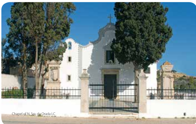
Chapel of N. Sra. da Orada LC

A typically rural chapel, built in a once deserted valley. Much frequented by fishermen, it contains "ex-votos" depicting miracles. In the churchyard, two graves belonging to victims of the constitutional struggles of the 19 th century are to be found.