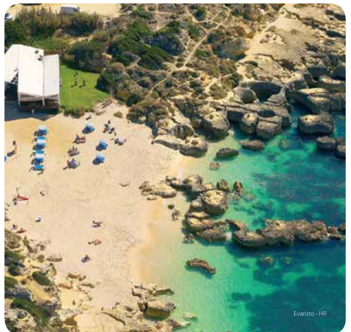
Evaristo - HR

Coves protected by rock formations. Great natural beauty.