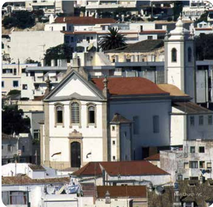
Main Church - VC

Built at the end of the 18 th century, the church possesses an imposing bell tower. The interior consists of a single nave. On the high altar there is a valuable statue of Nossa Senhora da Conceição (Our Lady of the Conception) (18 th century), the patron saint of Albufeira, and an altarpiece painted by the Algarvian artist Samora Barros (20 th century). The side altars and the sacristy contain statues from the 18 th and 19 th centuries.