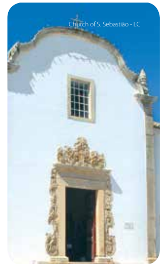
Church of S. Sebastião - LC

This church was built in the middle of the 18 th century and is located in the Praça Miguel Bombarda. Its architecture is popular in style. On the outside of the church, the outstanding features are a cupola and two doorways, of which the side one has stonework in the Manueline style, a fine example of Baroque decoration. The interior with a single nave has a wooden altarpiece from the second half of the 18 th century, six statues of saints, all made of wood and by unknown artists, and also a stone statue dating perhaps from the 16 th century, which must have belonged to the old Chapel of Nossa Senhora da Piedade (Our Lady of Piety).