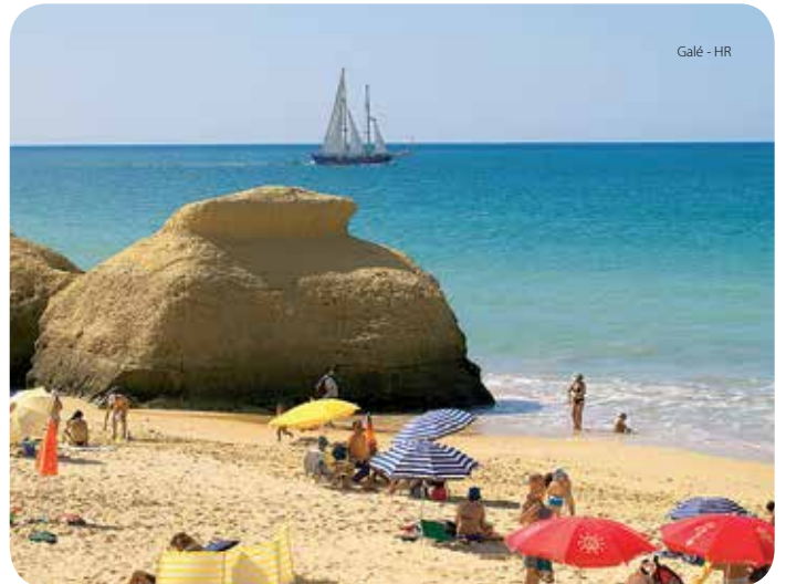
Galé - HR

An expanse of sand that stretches for miles between cliffs. It is equipped with a wide variety of tourist facilities. In the direction of Albufeira there are two small beaches that are quiet and little visited.