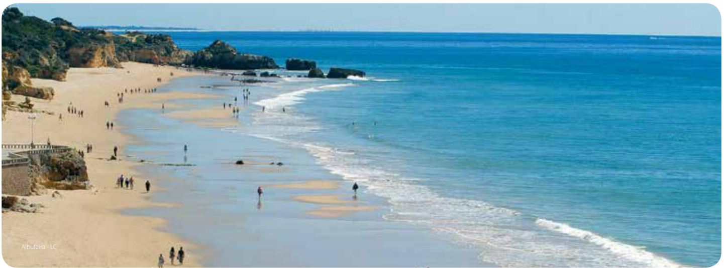
Albufeira - LC