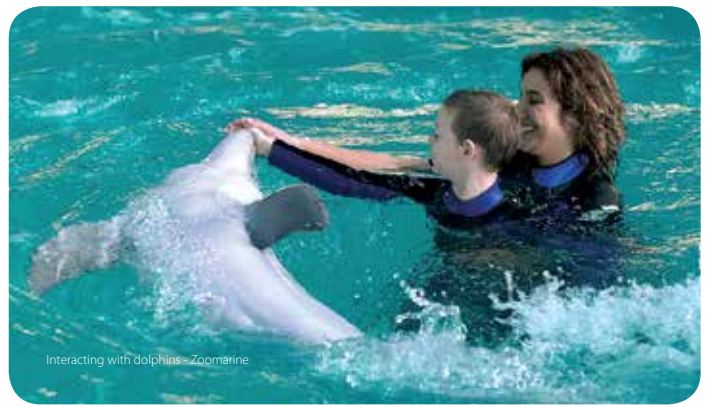
Interacting with dolphins - Zoomarine

Not far away, at the mouth of the Espiche creek, is Lagoa dos Salgados. With its typical lakeland vegetation, this is an excellent spot for watching migratory birds.